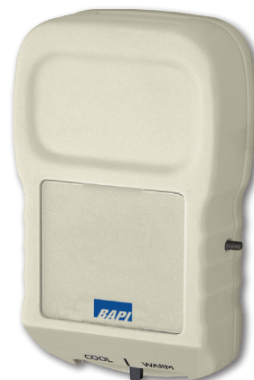
Transmitter with optional Temperature Setpoint & Override

The unit has an estimated battery life of 8 years using two high-capacity 3.6V lithium batteries with a transmit rate of once every 20 seconds. Each transmitter has a unique address with built in error detection. Each variable sent by the transmitter is picked up by the receiver and converted by a BAPI Analog Output Module to a voltage, current or resistance signal for the controller.