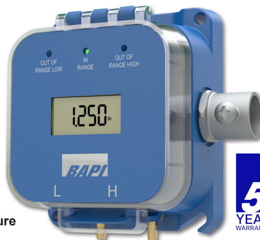
ZPM Pressure Sensor

Ranges and Outputs Can Be Set Easily Without Tools and Without Powering the Unit. Just open the hinged cover.