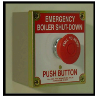
BSD120N1 Emergency Boiler Shut-Down