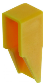
Insulating cap, Colour: Yellow