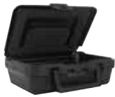
Protective Carrying Case