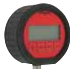
DPG with Protective Rubber Boot