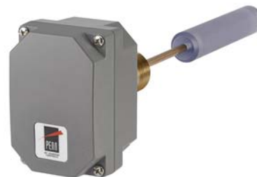
F263MAP-V01C Liquid Level Float Switch