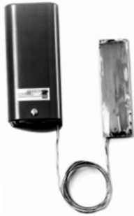
A19CAC-2 (Remote Bulb Model)