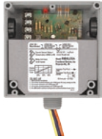
Functional Devices, Inc. A600C 2005