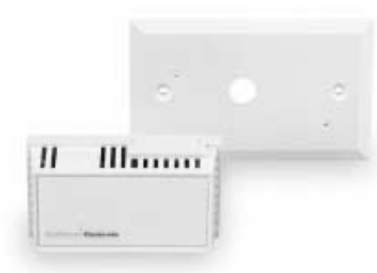
207-W Series Thermostat