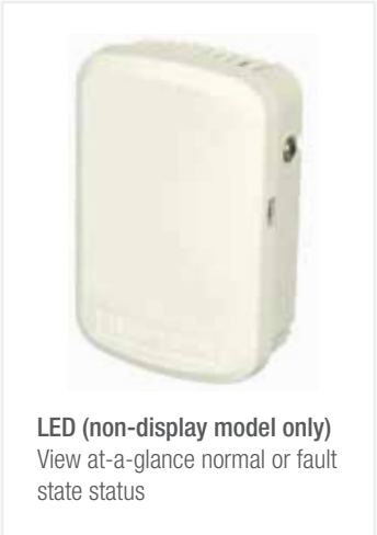
LED (non-display model only) View at-a-glance normal or fault state status

Calibration Port – Connect calibration tube for fast, accurate bump test; calibrate IAQPoint2 without opening the casing