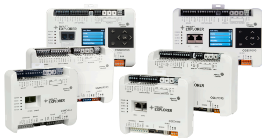
Figure 1: F4-CG General Purpose Application Controllers

The CG series general purpose application controllers are well-suited for controlling a wide variety of facility and HVAC equipment, including fan coils, air handling units, packaged HVAC equipment, and central plant equipment. CG series controllers run pre-engineered and user-programmed applications.