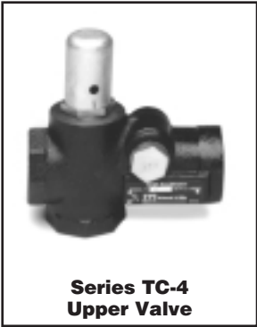
Series TC-4 Upper Valve