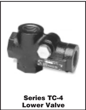
Series TC-4 Lower Valve