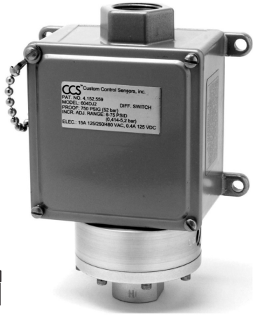
604D SHIPPING WT. APPROX. 41 OZ. (1162 GRAMS)