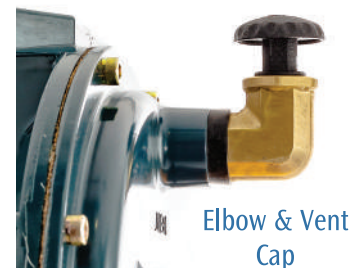
Elbow & Vent Cap