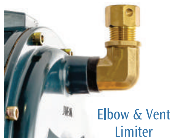
Elbow & Vent Limiter