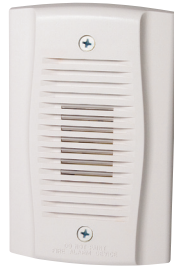
MHW UL S4011