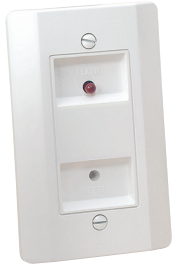
RTS451 UL S2522

System Sensor provides system flexibility with a variety of accessories, including two remote test stations and several different means of visible and audible system annunciation. As with our duct smoke detectors, all duct smoke detector accessories are UL listed.