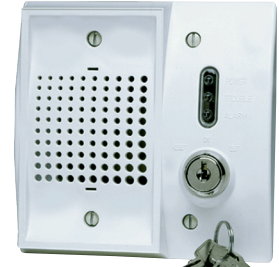
SSK451 UL S2522