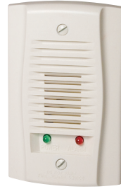
APA151 UL S4011