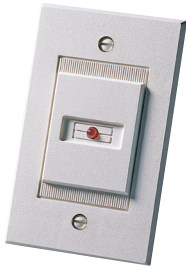
RA400Z UL S2522