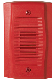
MHR UL S4011