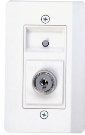
RTS451KEY UL S2522