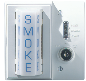
SSK451 with PS24LOW strobe and PS12/24 LENS lenses