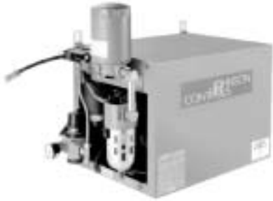
A-4400 Series Refrigerated Air Dryer with Optional Factory Mounted Air Purification System