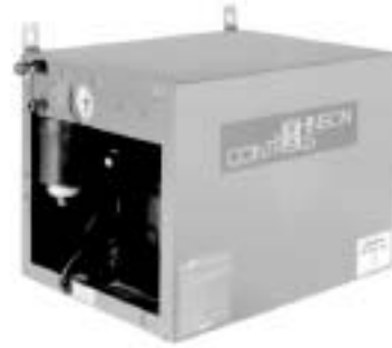
A-4400 Series Refrigerated Air Dryer without Optional Factory Mounted Air Purification System