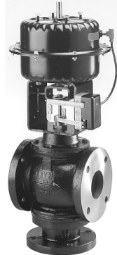
V-9502 Positioner Installed on a Rubber Diaphragm Type Valve Actuator