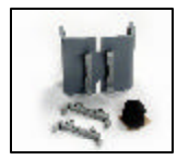
DRC DIN Rail Adapter