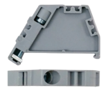
ADIN35ES Pair of End Stops for 35mm DIN Rail